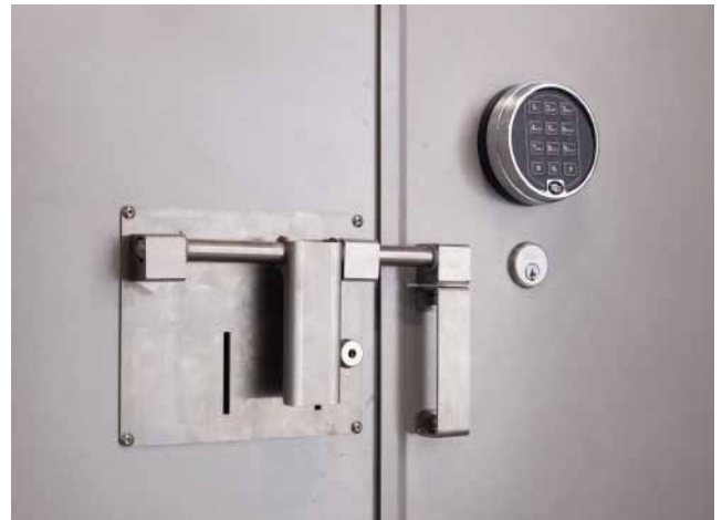
Rear Door Security