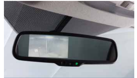
Camera screen on rear view mirror