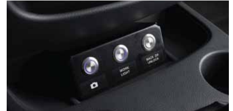
Control panel for locking and lighting system