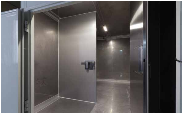
Double Door system Interior Lighting with Door Function