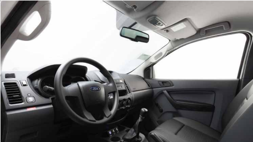
Ford ranger cash in transit interior